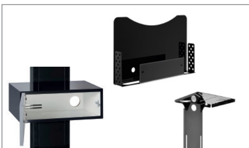
Expandable with accessories